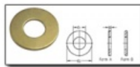
Brass washers DIN 125 washers brass DIN125 ISO 7089