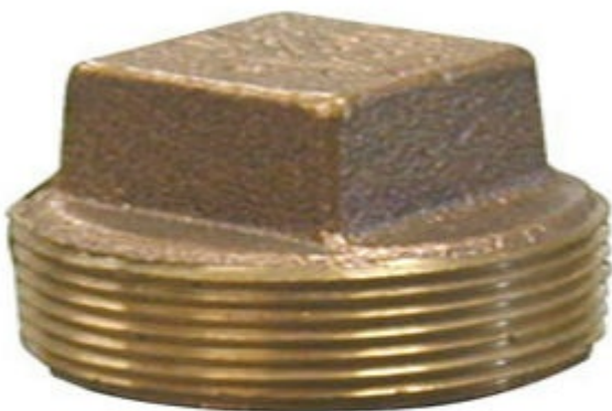
Bronze Plugs Pipe Plugs Bronze Gunmetal Stop end plugs Blanking Plugs Pipe end bronze Brass Plugs