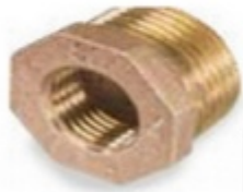
Bronze Bushes Bronze hex Bushes Threaded Bushes Fittings Hex Bushing Bushes